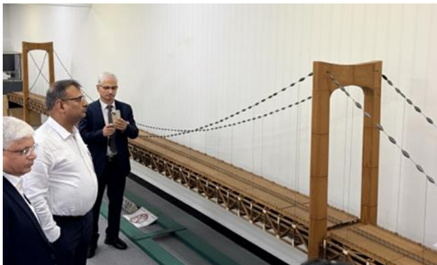
Rainbow Bridge Visit