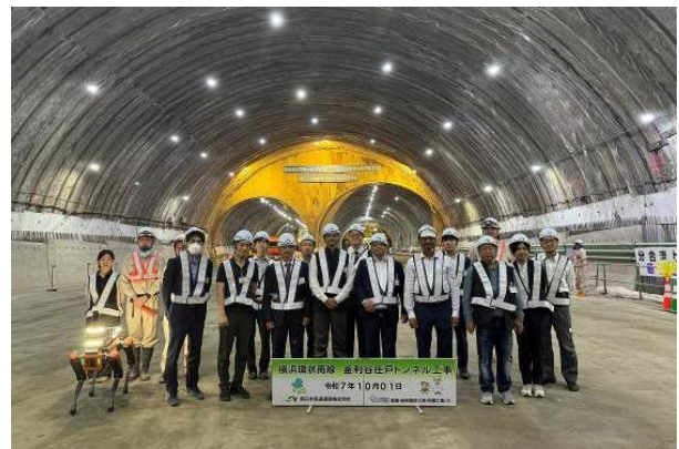
Kamariya Shodo Tunnel Construction Site visit