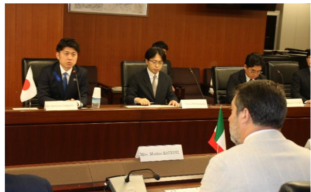
Scene of the meeting